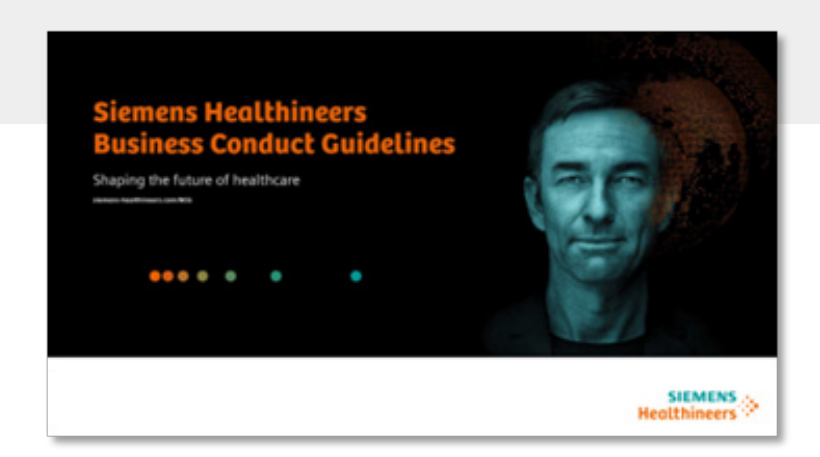
Fig. 2 – Siemens Healthineers Business Conduct Guidelines

Any exemption from the Code of Conduct is valid for a limited period and requires annual review. If no exemption is warranted in the circumstances of a particular entity who refuses to comply, Siemens Healthineers AU will refuse to engage further with that business partner.