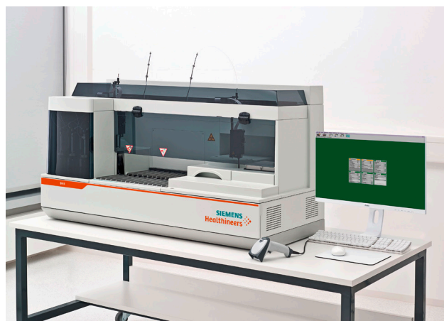
BN™ II System