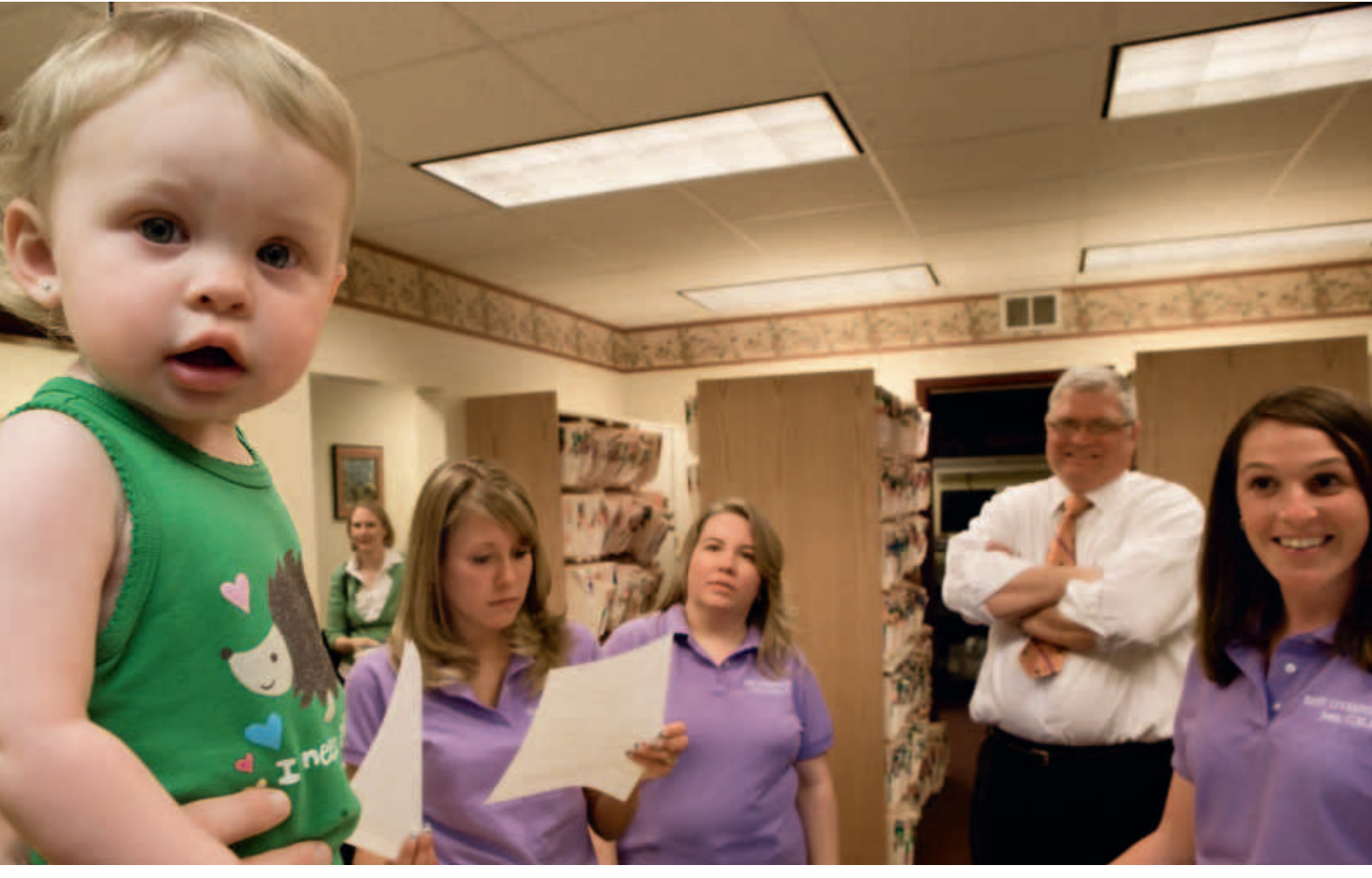
Allergies can start at a very young age.