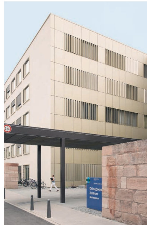
The city of Erlangen has a focus on healthcare with the University Hospital in its center.

Surgeons particularly appreciate the fact that they can enter many of the required settings manually at the operating table. They understandably wish to control the entire procedure without having to rely on third parties. The Erlangen-based physicians' experience of Cios Alpha's high level of controllability was thoroughly positive, and they noted that the remote user interface touch screen located directly in the sterile area of the operating table was particularly useful. It improves workflows and also has benefits for patient safety, explains Lang: “When I need to