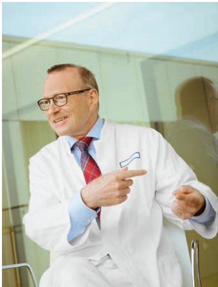
Professor Lang and his colleagues examined Cios Alpha for six weeks, with two to three procedures performed each day.

A primarily endovascular approach is gaining rapid popularity within diverse areas of modern vascular therapy. Professor Werner Lang cites stenosis treatment in the pelvic artery as one example of this trend: “The classic Y-prosthesis from the aorta to both leg arteries is hardly in use anymore, as the catheter procedure yields such good results.” Another fast-expanding field is the treatment of the lower-leg arteries. Specialized stents such as fenestrated and branched aortic stent grafts are now being used in endovascular procedures with increasing frequency. The key to the successful implementation of endovascular therapy options is intraoperative imaging, and its most important tool outside hybrid operating rooms is the mobile C-arm.