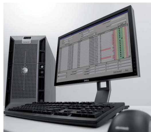
CentraLink Data Management System