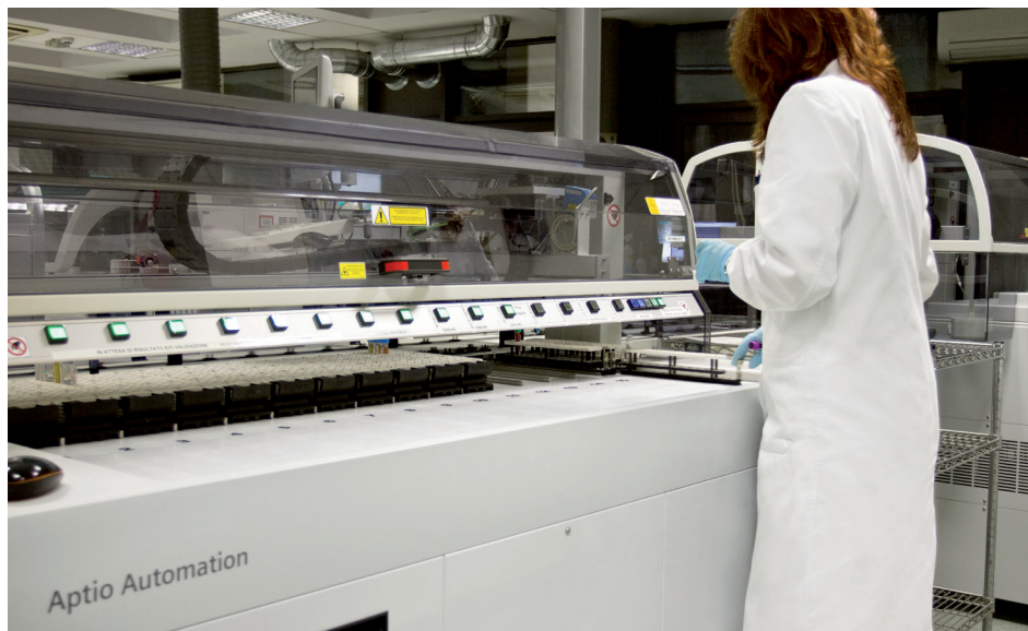
Aptio Automation in San Bartolo Hospital's core laboratory

Despite the steady annual growth in test volume, the laboratory was able to redeploy five full-time employees and close the STAT laboratory after implementing the ADVIA LabCell Automation Solution in 2001. Now, Aptio Automation permits the redeployment of an additional full-time employee.