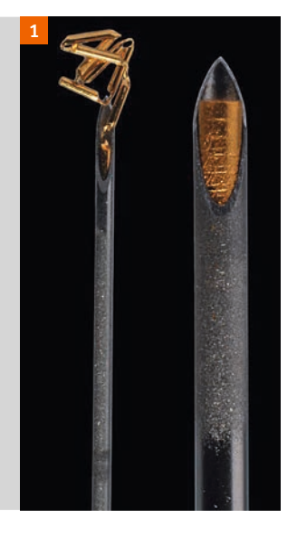
Figure 1: Gold Anchor to the left compared to traditional marker.

Flat-panel X-ray detectors based on amorphous silicon were developed rapidly in the early 2000s, resulting in lower dose requirements and improved image quality. By June 2004, the radiotherapy research institution Radiumhemmet at the