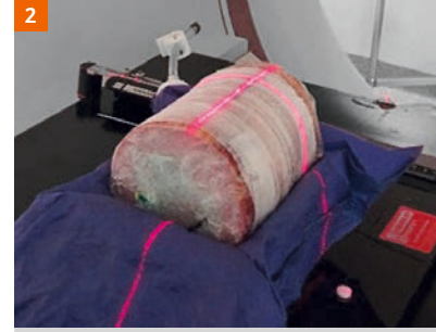
Figure 2 : A piece of pork loin, a salted (cured) and slightly smoked cut of pork with several Gold Anchors with different percentage contents of iron.