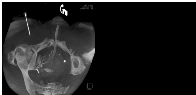
Thick MIP 48mm Frontal, sagittal and transversal view of pelvic vessels out of syngo DynaCT volume (low-dose setting).

The statements by Siemens' customers presented here are based on results that were achieved in the customer's unique setting. Since there is no "typical" hospital and many variables exist (e.g., hospital size, case mix, level of IT adoption), there can be no guarantee that other customers will achieve the same results.