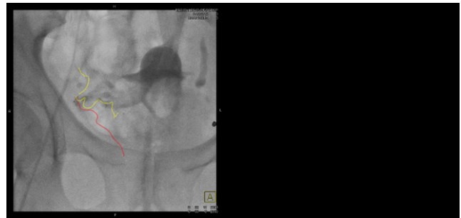
Store fluoro with syngo iPilot overlay of syngo Embolization Guidance centerlines. Protocol: Fluoro normal