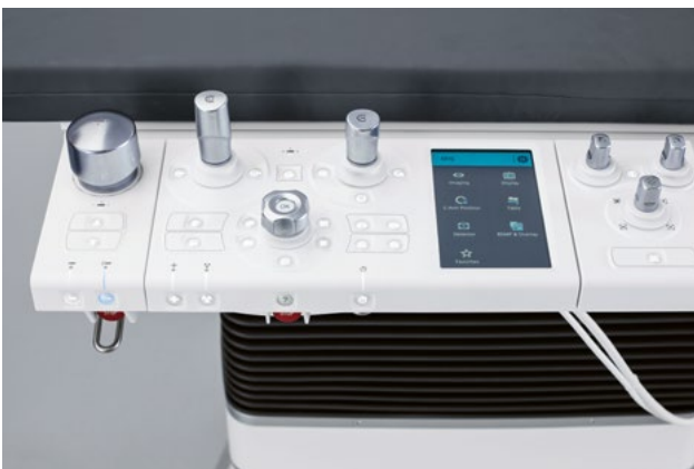
c) Control modules: • Wipe joysticks, buttons and surfaces. • Give attention to the gaps.