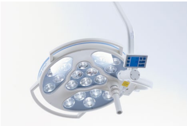
g) Operating light, in this order: • Illuminated area • Outer surface up to the first joint • Handles Work from clean to dirty areas.