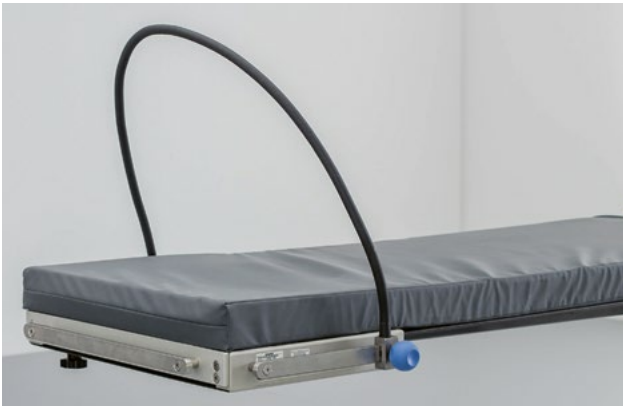
e) Wipe positioning aids and any other accessories used.