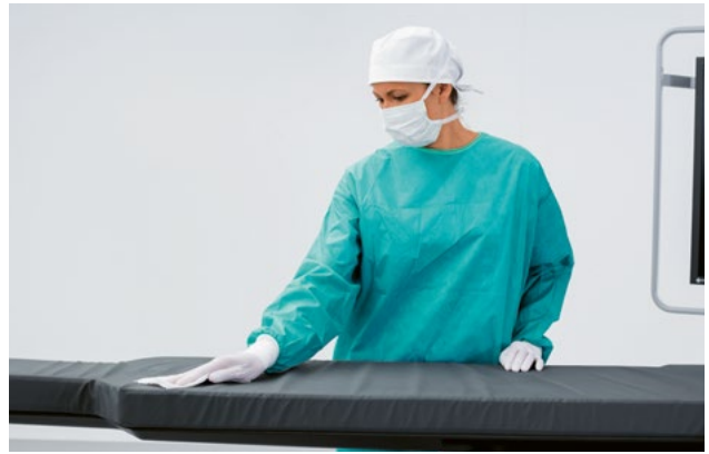
b) Patient mattress: Wipe from head-end to foot-end.