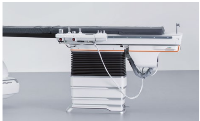
i) If necessary: • Base of the patient table • Trolley Wipe from the top down in each case.