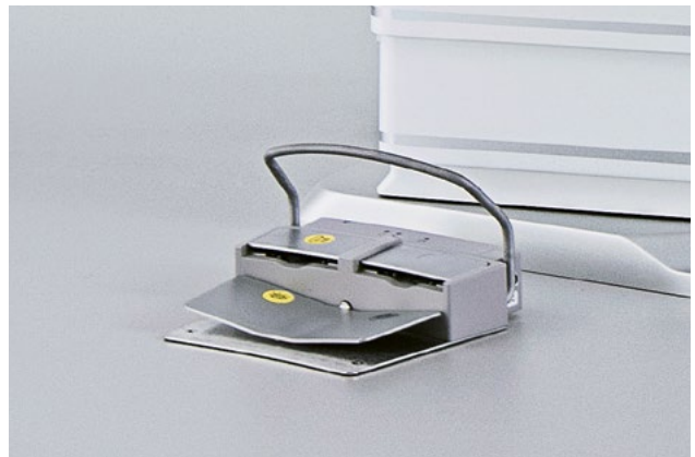
h) Wipe footswitch.