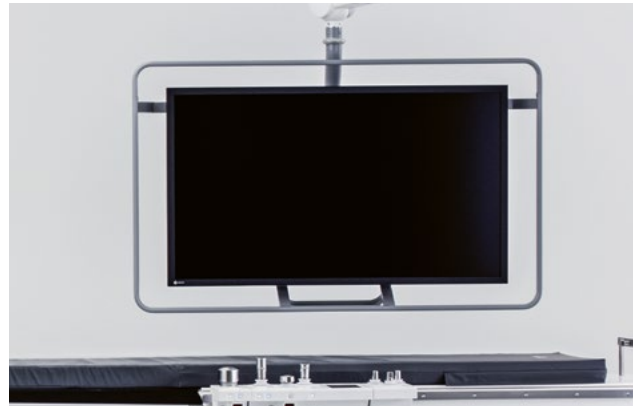
f) Handles of the monitors: Wipe from the top down in each case.