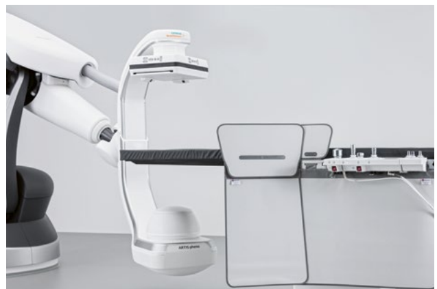
d) Upper- and lower-body radiation protection: Wipe from the top down in each case.