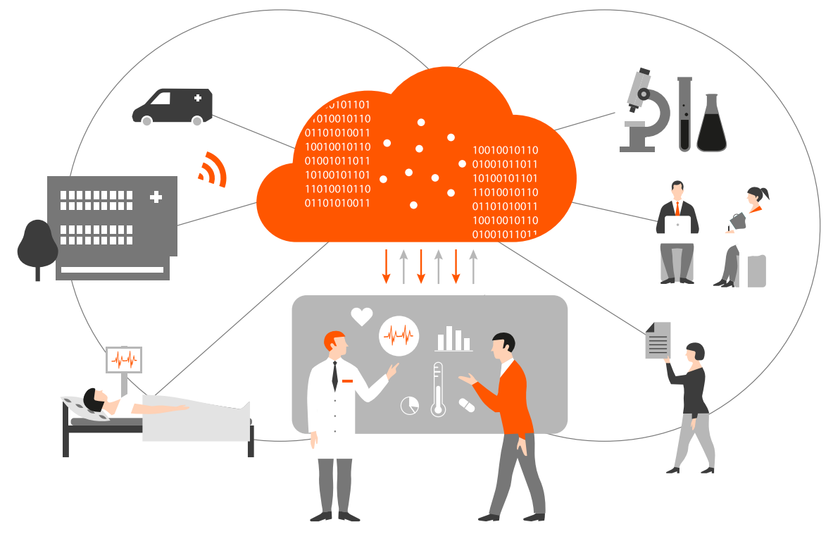
Healthcare 4.0 allows providers to connect more closely with their patients

"Healthcare 4.0 is all about capturing the vast amounts of data and putting it to work in applications."