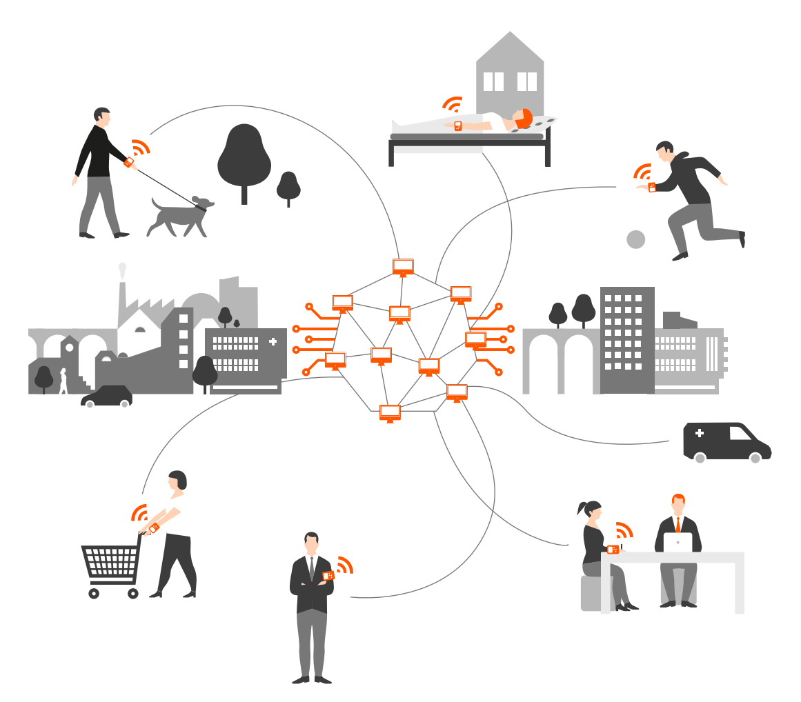
Growing amount of players in the rapidly expanding Internet of Medical Things (IoMT)