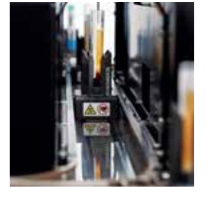
Highly efficient laboratory solutions that transform care delivery

There are 7.2 billion people on Earth, and each one deserves accurate diagnostic results. Whether you need the highest immunoassay testing throughput,<sup>1</sup> a handheld blood gas analyzer that can deliver results in less than one minute,<sup>2</sup> a true high-sensitivity troponin I assay, one of the largest ranges of molecular assays for infectious disease testing,<sup>3</sup>