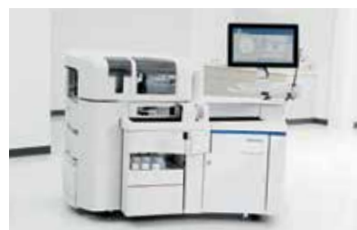
ADVIA Centaur XPT System