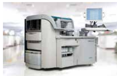
ADVIA Centaur XP System