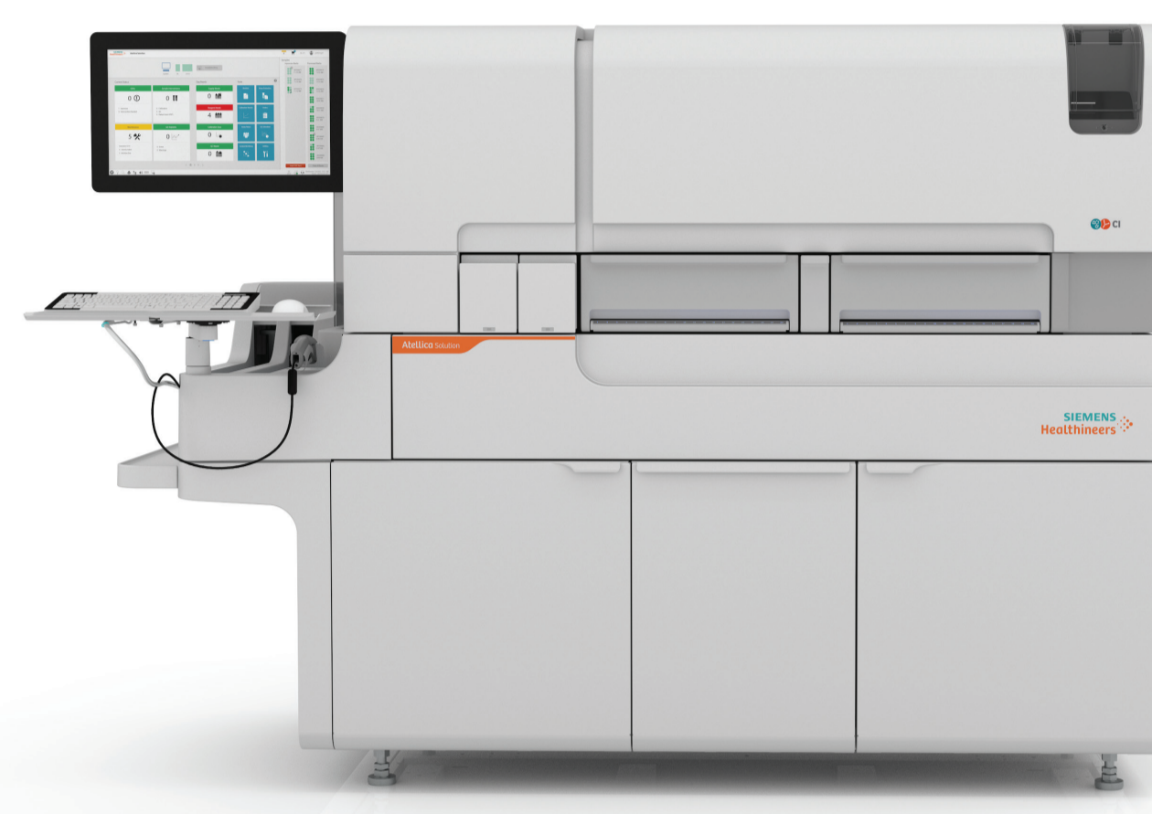
Figure 1. The Atellica CI Analyzer

To evaluate the analytical performance of the Atellica IM assays using this recent analyzer, precision, method comparison (MC), limit of blank, detection, quantitation (LoB, LoD, LoQ), and linearity studies were assessed as performance indicators for the Atellica IM AMH assay on the Atellica CI Analyzer.