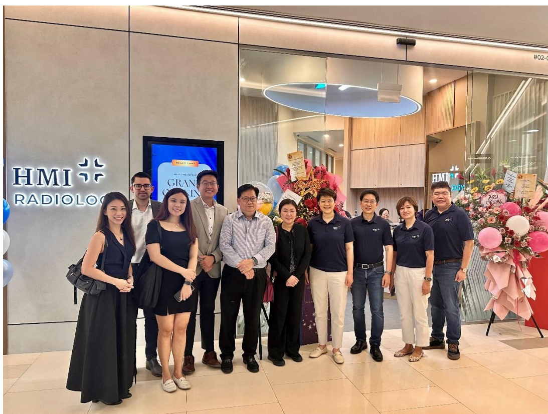
The management of HMI Medical and Siemens Healthineers at the HMI Radiology center opening on 18 October.

Notably, the MAGNETOM Lumina 3T MRI offers a more comfortable and efficient scanning experience compared to traditional systems, producing high-resolution images that enable clinicians detect health issues with greater accuracy, while reducing scan times and enhancing patient comfort.