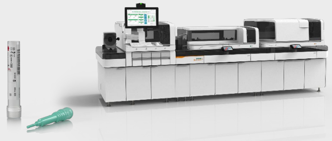
Patient Sample Collection Tube Sentinel FOB Gold® Tube Screen