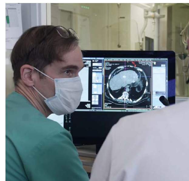
Visualization of angio and CT images using the Artis Cockpit