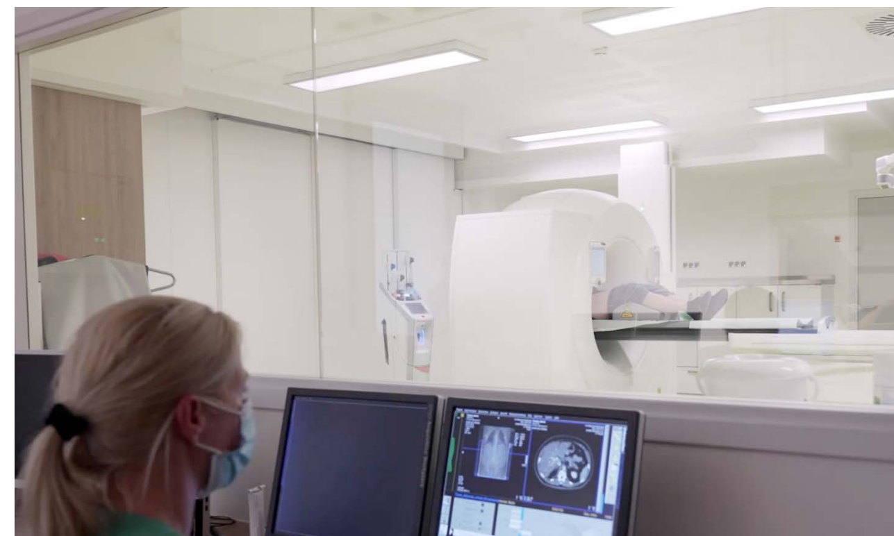
Diagnostic CT scan, independent of the angiography system

University Hospital Giessen and Marburg GmbH (UKGM) is a hospital operated by Rhön Klinikum AG. It was formed from the university hospitals of Justus Liebig University Giessen and the University of Marburg in Hesse. The University Hospital Marburg is a maximum care hospital with 1,146 beds and 9,700 members of staff. It is responsible for the care of about 500,000 people. The Department of Diagnostic and Interventional Radiology carries out over 130,000 diagnostic procedures and some 2,800 interventions each year. In addition to modern imaging using the full range of imaging techniques, the department places a particular focus on microinvasive tumor therapy ("Interventional Oncology") and the interventional treatment of vascular diseases. These can be tackled using numerous transarterial and percutaneous techniques.