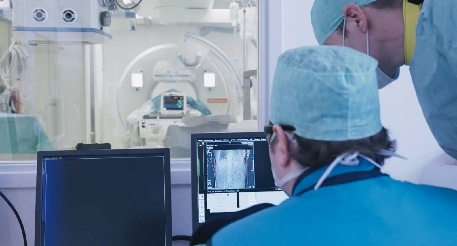
Planning a CT scan for a combined Angio-CT intervention

At our department, the two systems that make up Nexaris Angio-CT – that is, the angiography and CT systems – are installed in two different rooms separated by a movable wall. Each system is operated to its full productive capacity. Once or twice a day, we also use the angiography system in a hybrid manner by bringing the CT scanner into the angiography room – thereby deriving the maximum benefit from this combined application for our patients. Both systems are highly robust tools that enable us to cover the broad spectrum of radiology – including diagnostic and interventional CT and diagnostic and interventional angiography.