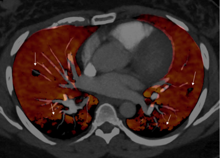
Figure 2a - Ground Glass Patches from COVID pneumonia