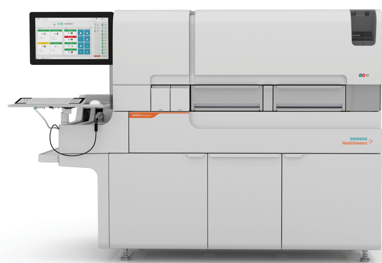
Figure 1. The Atellica CI Analyzer

To evaluate the analytical performance of the Atellica IM assays using this recent analyzer, precision, method comparison (MC), limit of blank, detection, quantitation (LoB, LoD, LoQ), and linearity studies were assessed as performance indicators for the Atellica IM aHBs2 assay on the Atellica CI Analyzer.