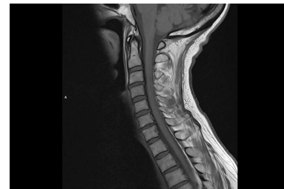
Clinical image of a spine scan.

For some MRI examinations, a contrast medium (sometimes called a dye) is given to help highlight a particular area of your body. Depending on the type of exam, contrast medium is administered in a number of different ways. You might, for example, be asked to drink it or it might be injected into a vein.