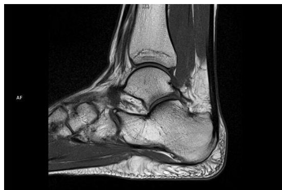
Clinical image of a foot/ankle scan.

MRI stands for magnetic resonance imaging. Unlike x-ray or CT (computed tomography), MRI does not expose you to radiation. Instead, MRI uses magnetic fields and radio waves to identify different body tissue and differentiate individual anatomy. This type of imaging can be very helpful in diagnosing injuries or fractures, or in identifying disease in its earliest stages.