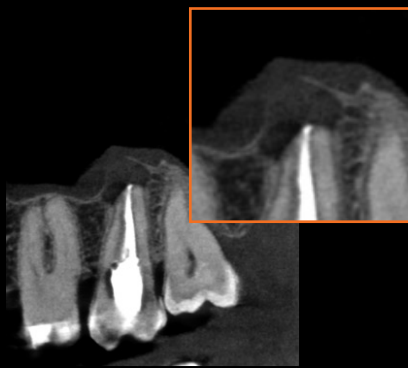
CBCT image Delineating the lesion No information on lesion status

Leveraging the unique advantage of MRI in visualizing soft tissue with exquisite contrast, the invisible tissue structures and lesions can potentially be made visible.